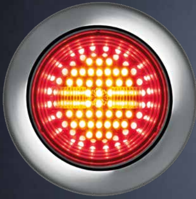
Part No. 800606 (LEFT), 800607 (RIGHT) IZE LED TAIL LIGHT 3 FUNCTIONS LED