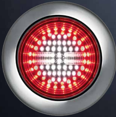
Part No. 800609 IZE LED TAIL LIGHT 2 FUNCTIONS LED