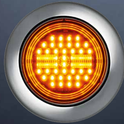
Part No. 800601 IZE LED TAIL LIGHT 1 FUNCTION LED