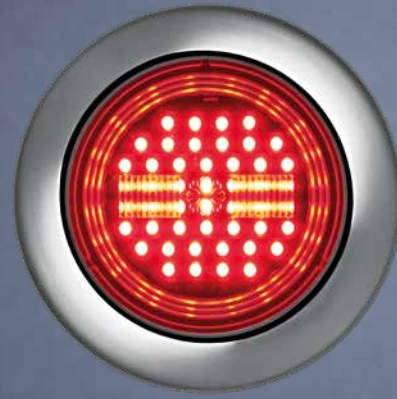
Part No. 800600 IZE LED TAIL LIGHT 2 FUNCTIONS LED